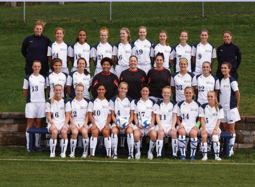
The 2009 women's soccer team set a record for the most victories in a season.