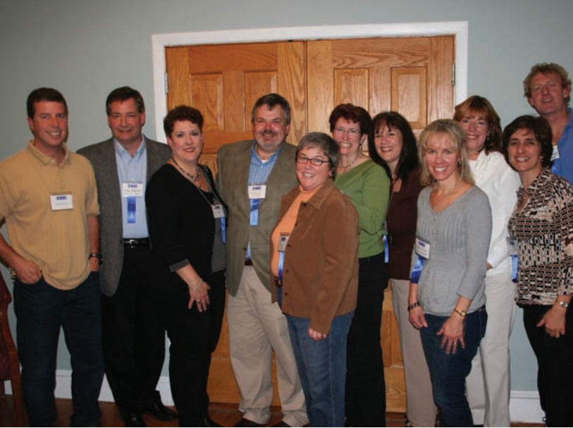
The 25th reunion Class of 1984 had a great weekend, culminating with a class dinner at Jae's Inn.